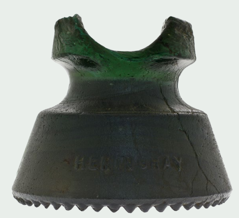
Hemingray No 42 digitally reconstructed unit