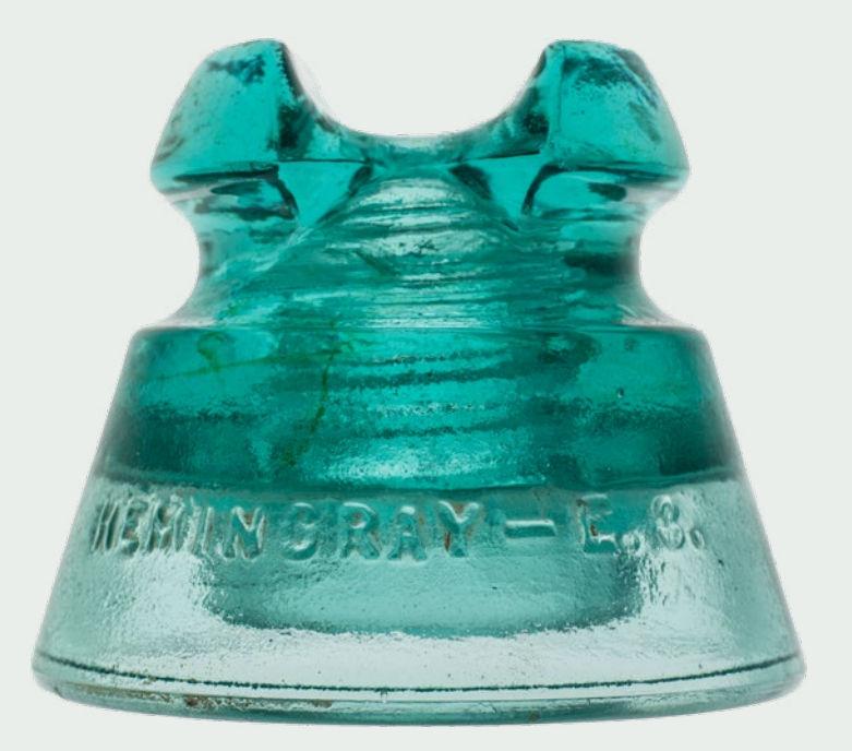
Hemingray E.3. for comparison